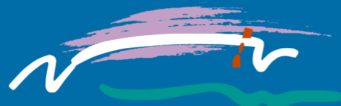
TABLE MOUNTAIN AERIAL CABLEWAY Co. Ltd.